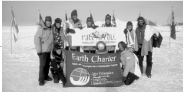
"Pole to Pole" Youth Team at the South Pole 1 January 2001

The Earth Charter is a declaration of fundamental principles for building a just, sustainable, and peaceful global society in the 21st century. It seeks to inspire in all peoples a new sense of global interdependence and shared responsibility for the well-being of the human family and the larger living world. It is an expression of hope and a call to help create a global partnership at a critical juncture in history. Some frequently asked questions and answers are presented below. Further detail on these and other issues is provided in subsequent chapters.