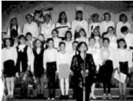
Tartastan school children sing to Earth Charter delegation visiting Kazan

Many groups and organizations have endorsed the Earth Charter and are using it in their programs. The following list examples of national and international organizations that have endorsed the Earth Charter.