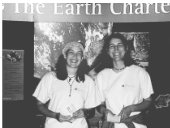
USA Earth Charter stall at Earth Day celebrations

The Earth Charter Initiative is encouraging people to make use of the Earth Charter in their personal lives and in organizations to which they belong. There are four main ways in which you can become involved and contribute to promoting the aims of the Earth Charter Initiative.