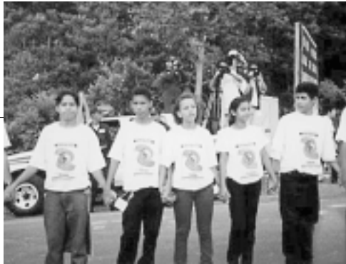
Some of the 4,000 children who participated in "Embracing the Earth" 3 December 1998 Mato Grosso, Brazil

The Earth Charter International Secretariat in Costa Rica is developing and implementing a range of programs over 2001/2002 and beyond in areas such as education, business and professional accountability, religion and spirituality, media outreach, a culture of peace, and governance.